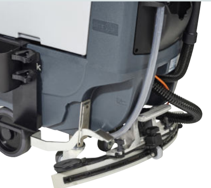
Increased suction performance with the curved squeegee system and patented blade retainer