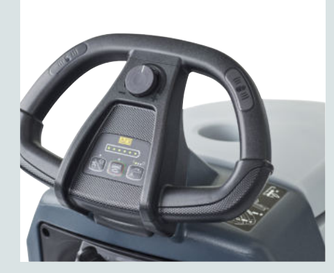
Ergonomic handle with touchpoints, One-Touch™ button and instruction stickers makes the machine simple for the operator to get started