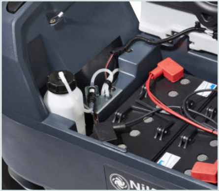
Detergent mixing system gives the user the option to clean with water only and to add detergent when really needed