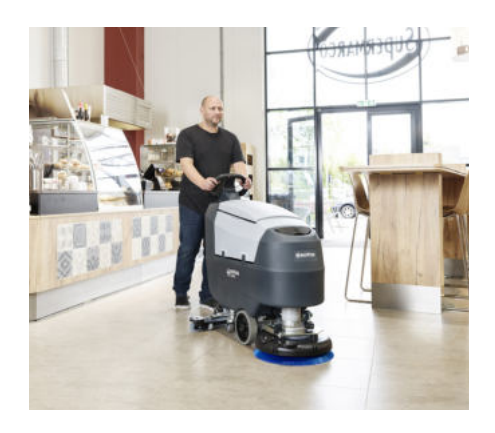
The Nilfisk SilentTech™ technology reduces the sound level from 65dB(A) - and down to 60dB(A) in silent mode